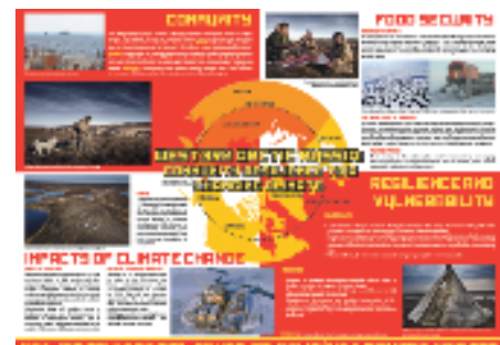
Student posters presented as part of a group assessment

"The fact that we now have a dynamic couple of years in which we are extremely collegial did effect the way that students engaged with us... the three of us were in the classroom a lot, this wasn't just a team taught unit in terms of serial teaching. Being in the classroom together and negotiating things with each other in front of students... that kind of distributed leadership within the classroom transferred really well and modeled really well to students and then picked up the opportunities we gave them in the unit to lead what happened.." - Aidan Davison