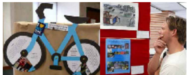
The 'Tackling Climate Change' Exhibition, Murdoch Library.

The 1 st year students also participated in a survey and joint tutorial with students in a similar subject in the University of San Diego in which they discussed the perceptions they had of each other's country's in relation to resource consumption and climate change.