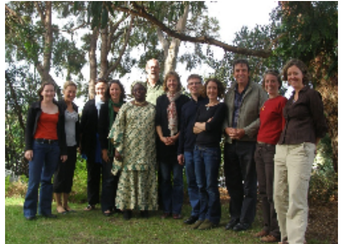
End of Year Retreat, Hobart

Much reflection has been undertaken regarding the reality of facilitating student-led learning and the practicalities of distributed leadership. These ideas were discussed at length at the end of year Retreat held in Hobart, November 29 th and 30 th .